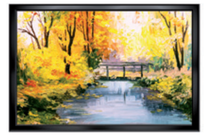
Recommended humidity for paintings or galleries: 50%RH