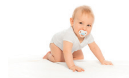
Recommended humidity for a person: 40–60%RH