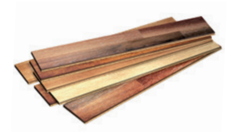
Recommended humidity for wooden furniture and parquet flooring: 55–60%RH